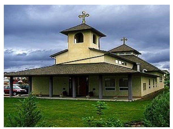
St. Herman of Alaska Orthodox Church

From Yellowhead Freeway: Travel East or West to 170 St. exit and proceed South for 4 kilometers to 100 Ave. Turn left and travel three blocks to 167 St. The Church is on your right (behind the condos).